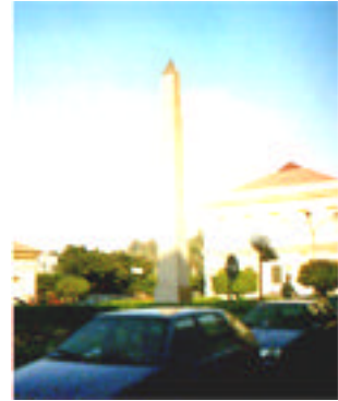
Faculty of Engineering -Cairo Fig. (19)