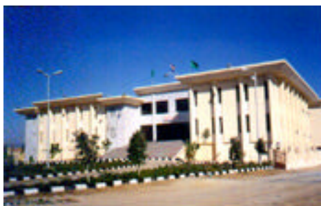
A Governmental Building Cairo Alex. Desert Road fig (28)