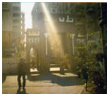
Teba-Shopping Mall Fig. (15)