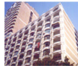
Residential building Fig. (4)

Even the apartment building in fig (2), although featuring the Islamic architectural vocabulary in a very strong & evident manner, still can not define where it could be found. It could be in any city in the Middle East. Figure (3) illustrates an office building designed with the international style that could also be in any place in the world. As for the classical European architecture with its different areas, common people can not differentiate between German or French interpretations of each era. Down town Cairo for example, was planned according to 19 th century European theories of planning with main department stores as a replica of similar ones in Paris. Figure (4) illustrates a residential building in Cairo with classical European vocabulary reflecting no Egyptian identity. Why then, whenever we see these buildings we have doubts about where there are located, while when seeing a pyramid everyone on earth is sure that it must be in Egypt or copying from the Egyptian pharonic architecture. The Washington Memorial fig (5) and the Pyramid de Louvre in Paris fig (6) illustrates how clear is the Pharonic identity even when used in different remote countries.