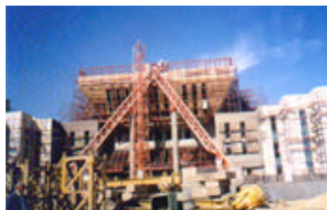
Click Office Building 6 October City fig (29)