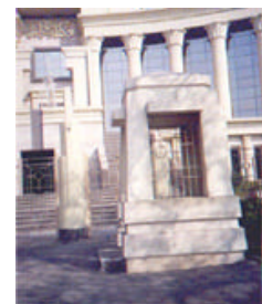
3)Security gate fig(36c)