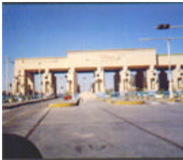
Cairo –Alex Desert Road Toll-Station Fig. (11)

On the contrary, the Teba-Mall side gate way fig (15) is a poor example due to the naïve combination of pharonic architecture represented by the titled planes & granite cladding & the Islamic architecture represented by the point arches. It is known that the pharonic architecture vocabulary did not have any circular arches.