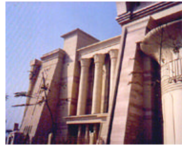
Tilled plans (c)