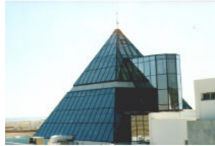
Sharm el Sheik hospitals Fig. (24)

The Mubarak Police academy fig (25a,b) is a contemporary example of a public educational building with a design that reflects pharonic heritage. The pharonic style is very appropriate when applied to office buildings as it reflects the stability and strength of the businesses operating in them. Fig (28), (29)