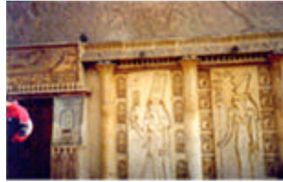
Bazaars at Pyramid St. fig (30b)