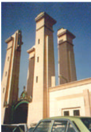
Cairo University hostel Main Entrance Fig. (14)