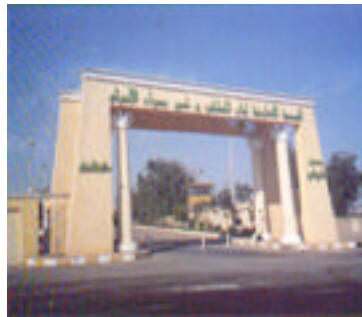
Gate to a residential Compound pyramids Fig. (12)