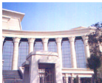
2)Circular arrangements of columns fig(36b)