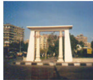
Gate to a park In mohandessen Fig. (13)