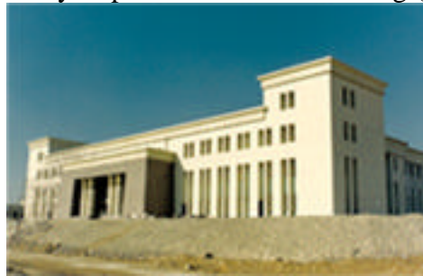
Mubark Police academy Fig. (25b)