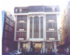
Office building Fig. (2) Mosque Fig. (1)