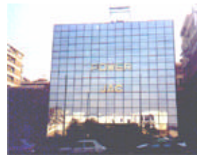
Modern style Fig. (3)