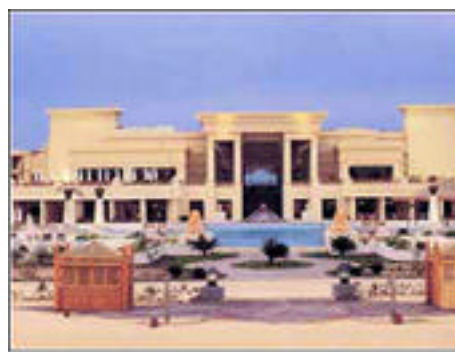
Sheraton Somabay fig (32)