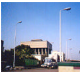
Before fig (33a)

The renewal of the elevated water tank in Giza fig(33) and how by a simple touch, the structure reflected another image & meanings is a complete success.