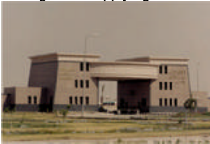
Mubark Police academy Fig. (25a)

Also embassies and national agencies with international exposure can send a very strong message when applying some vocabulary of pharonic architecture. Fig (26), (27)