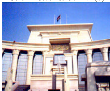
The main entrance symmetry (e)