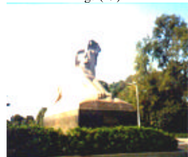
Nahdet Misr Sculpture is an artist proof that the future of Egypt is based on its Pharonic roots. Fig. (22)