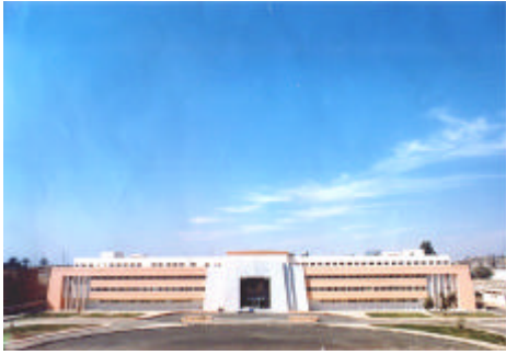
Luxor hospitals Fig. (23)