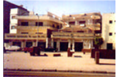
Bazaars at Pyramid St fig (30c)