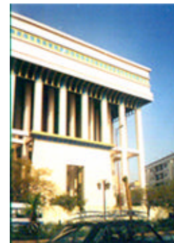
fig (33c) After

On the other hand, the way the side walks under the 6 th October Bridge from both sides in Cairo & Giza cities is a complete failure. Wrong proportions, poor workmanship & an ugly design .It is a shame and degrading to our heritage.