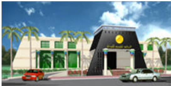
National Woman Council fig (26) The Egyptian Embassy Berlin- Contest fig (27) Designed by researcher