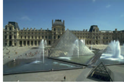
Pyramid de Louvre Paris Fig. (6)