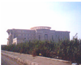
1)Dome over building fig(36a)