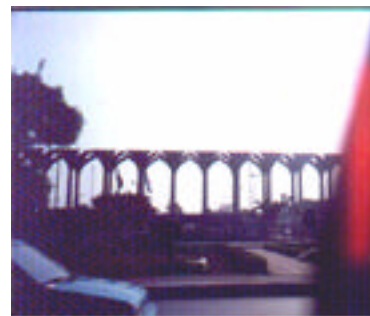
Cairo Fair main Entrance Fig. (16)