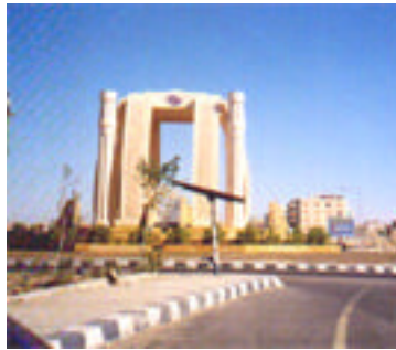
Click Square 6 October City Fig. (18)