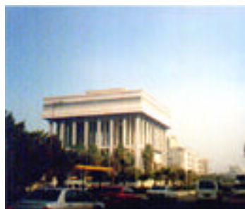
After fig (33b)