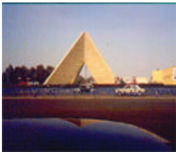
The Unknown Soldier Monument Is an example of how can an abstract design reflect the meaning Fig. (20)