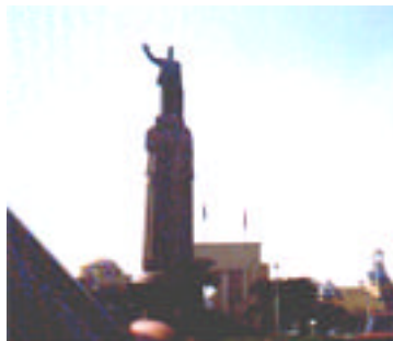
Saad Zaghlol Statue The use of Pharonic vocabulary in the base to add strength & power to the statue Fig. (21)