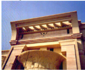
Column detail & Cornish (b)