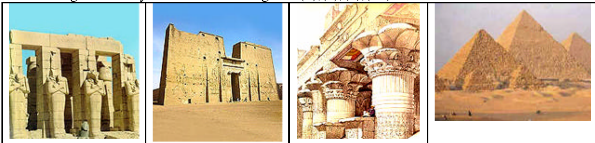
Scale Fig. (7)

In order to design buildings reflecting the pharonic heritage and make them appreciated easily by the Egyptian community, here are some of the most significant basic vocabulary that symbolize the pharonic architecture and were stated in most of the reference books concerning the history of architecture. Figures (7),(8),(9),(10)