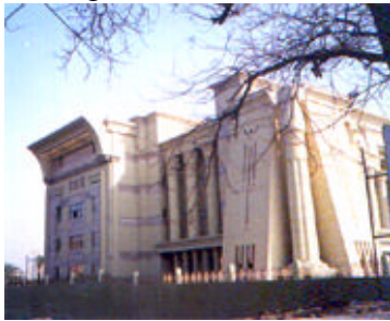
Use of proper material (a)

It is one of the most famous buildings built during the past 5 years with a clear and strong message. The whole building is a good example of the use of all vocabulary items that constitute the pharonic architecture. A successful design of all elevations, proper choice of finishing materials and color scheme. Fig (35)