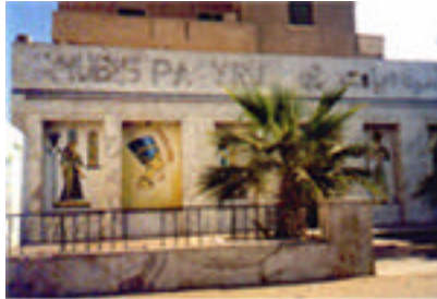
Bazaars at Pyramid St fig (30a)

Hotels are among the best building type adopting the pharonic design, as most of its users are tourists coming to see the real heritage and are ready mentally to appreciate such designs. These designs should be handled with extreme sensitivity to minimize the risk of comparing the design with the real heritage. Fig(30a,b,c) (31) (32).