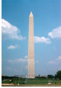
Washington memorial Fig. (5)